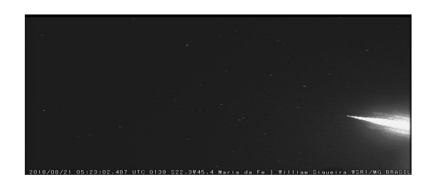
FIGURE 1. Meteor registered by station WSR1.